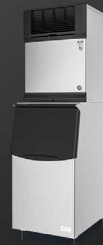
一體式製冰機 Self Contained Type