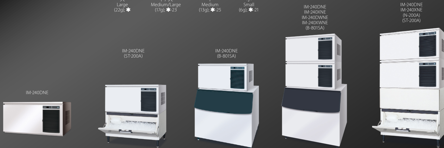
組合式製冰機 Modular Type